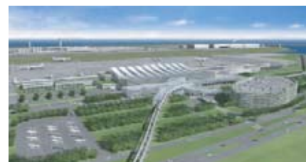
New International Terminal at Haneda Airport

American currently operates nonstop service to Tokyo's Narita airport using Boeing 777 aircraft from Chicago (daily), Dallas/Fort Worth (twice daily), Los Angeles (daily), and New York JFK (daily). Under a codeshare arrangement between JAL and American, JAL displays its JL code on each of American's U.S.-Tokyo flights and American displays the AA code on daily flights operated by JAL between Narita and Chicago, Los Angeles, New York (JFK), and San Francisco.