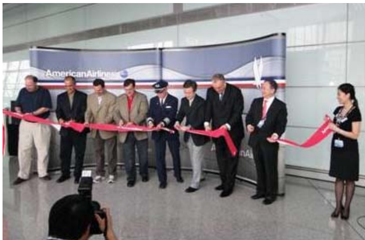
Ribbon cutting ceremony for AA186 before it took off from Beijing Int'l Airport.

The new route, which will operate four nonstop flights per week between Chicago's O'Hare International Airport and Beijing through July 2, complements existing daily flights between Chicago and Shanghai. This service introduction reinforces American's position as the bridge between the United States and the Peoples Republic of China, and the airline's long-term commitment to offer a quality travel experience to all customers in China. Beginning July 3, American will offer daily departures from both cities.